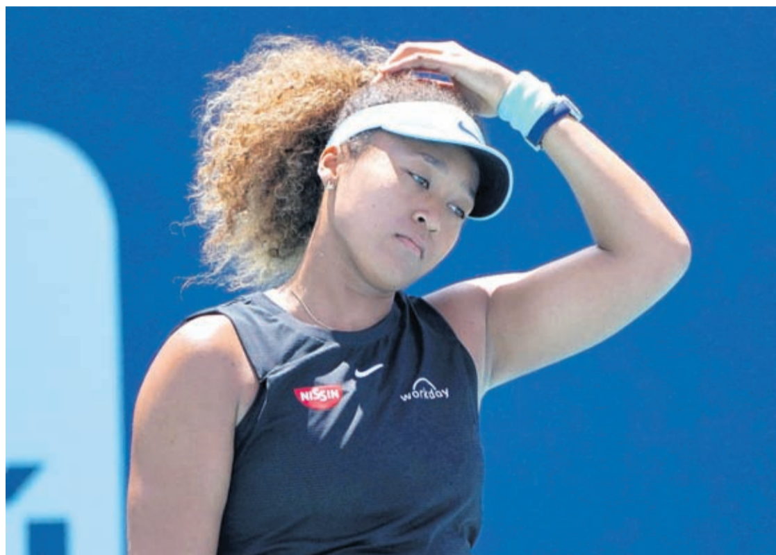
Naomi Osaka, of Japan, reacts during her match against Maria Sakkari, of Greece, in the quarterfinals of the Miami Open tennis tournament in Miami Gardens, Fla., in this Wednesday, March 31, 2021, file photo.

Osaka rebounded a bit in a second statement announcing her withdrawal, and that's where it gets